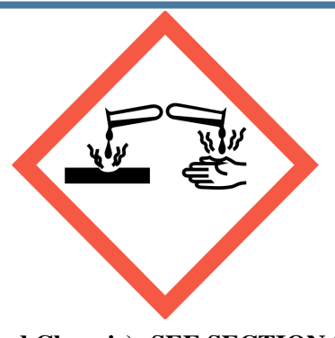
Signal Word: WARNING! - FOR HEALTH EFFECTS (Acute and Chronic): SEE SECTION 11