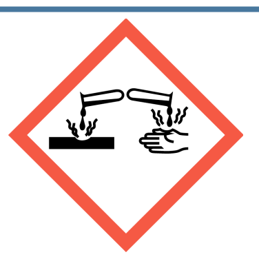
Signal Word: DANGER! - FOR HEALTH EFFECTS (Acute and Chronic): SEE SECTION 11